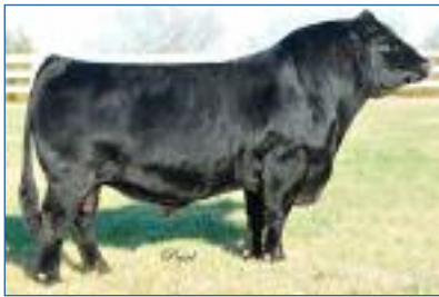
CNS Pays To Dream