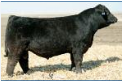
CCR Cowboy Cut